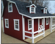
Small dormer with window