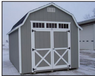
Above the door