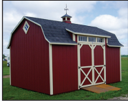
Bank barn dormer with transom windows