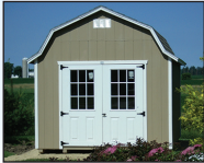
Fiberglass Square Window