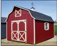
Flying Gable with false hay mow door